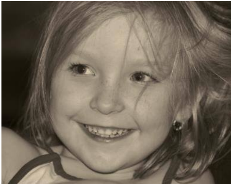
When she was 3, her heart seized and she was gone, but I was blessed with the ability to save her life, start her heart again, put her back into her mothers arms.

“It is not for the children to face more than the dreams of a child”.